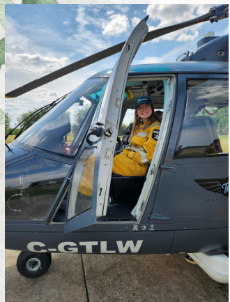
Eve with Junior Forest Rangers

NOTE: Applications for summer 2026 programming will open in early 2026.