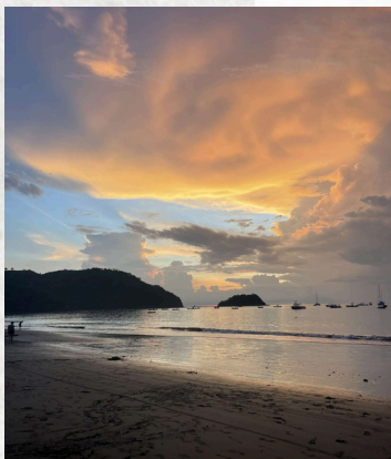
Beautiful Coco beach in Costa Rica