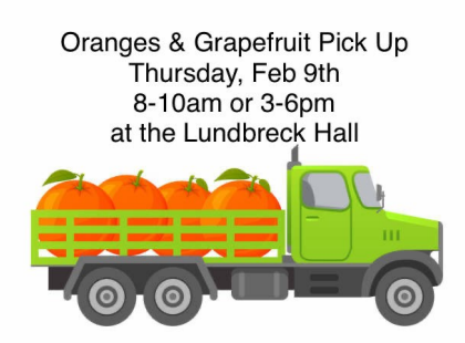
Thank you so much for supporting our Livingstone Athletics.

We look forward to a great day of activities. Groups will depart from the school after bus arrival and attendance has been taken. Make sure to pack a big lunch!